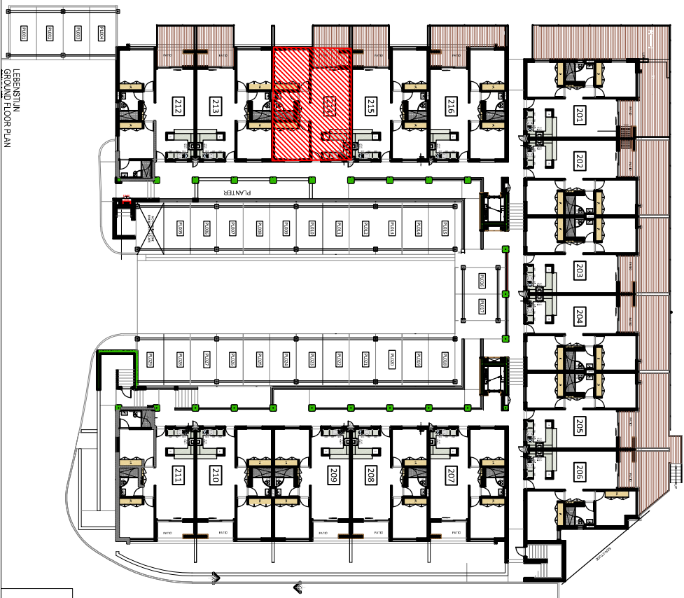
LEBENSTIJN GROUND FLOOR MASTER PLAN - Scale 1:500