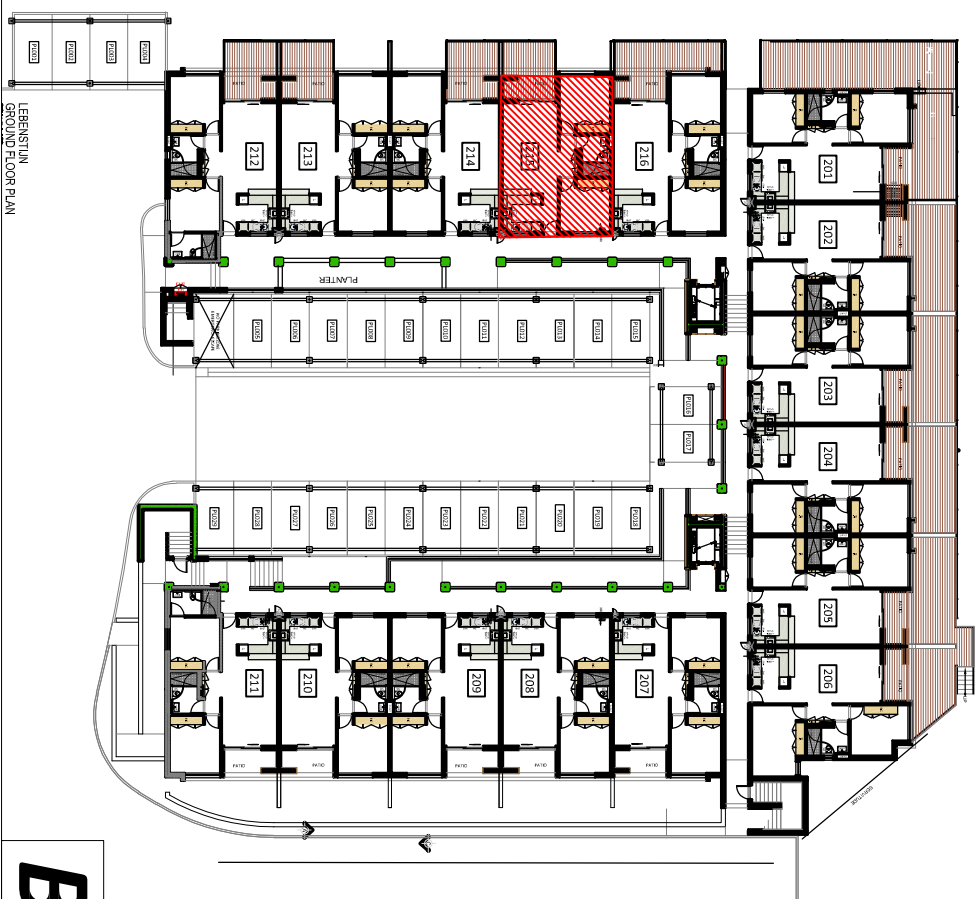
LEBENSTIJN GROUND FLOOR MASTER PLAN - Scale 1:500