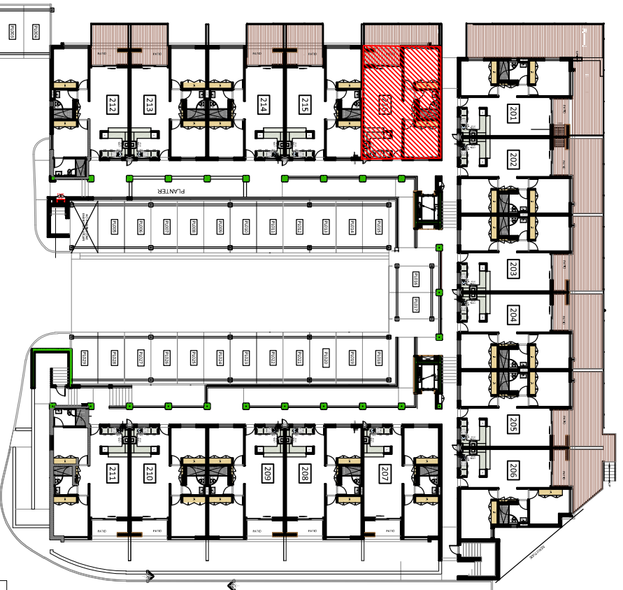
LEBENSTIJN GROUND FLOOR MASTER PLAN - Scale 1:500