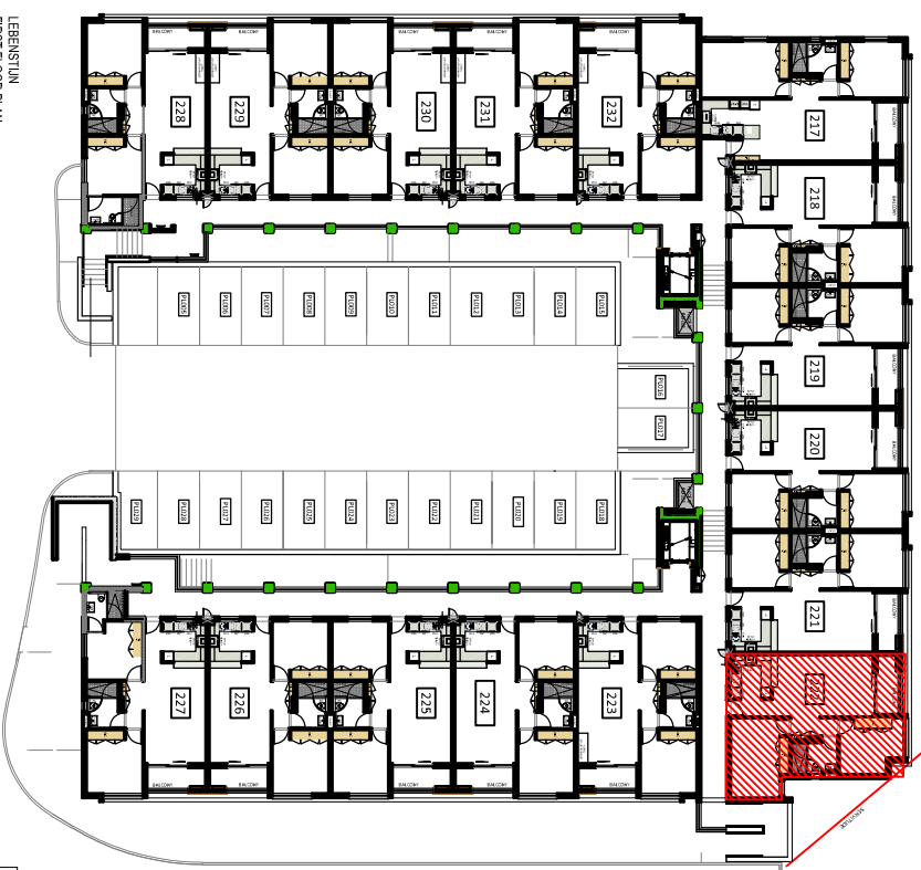
LEBENSTIJN FIRST FLOOR PLAN