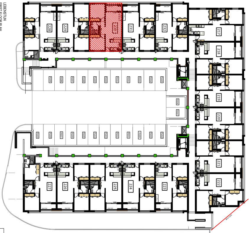
LEBENSTUJN FIRST FLOOR PLAN