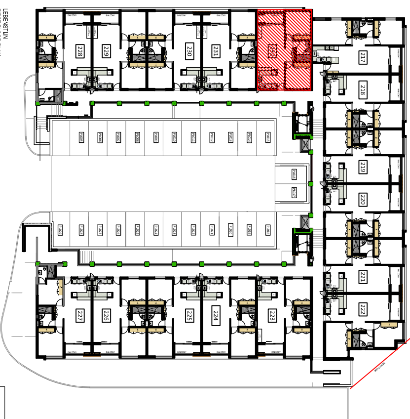
LEBENSTIJN FIRST FLOOR PLAN