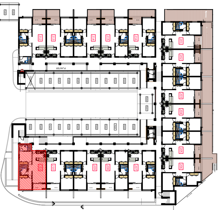
LEBENSTIJN GROUND FLOOR MASTER PLAN - Scale 1:500