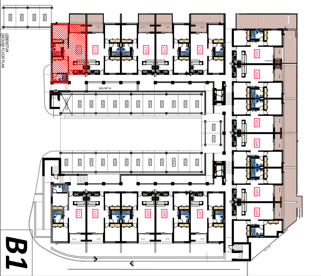
LEBENSTIJN GROUND FLOOR MASTER PLAN - Scale 1:500